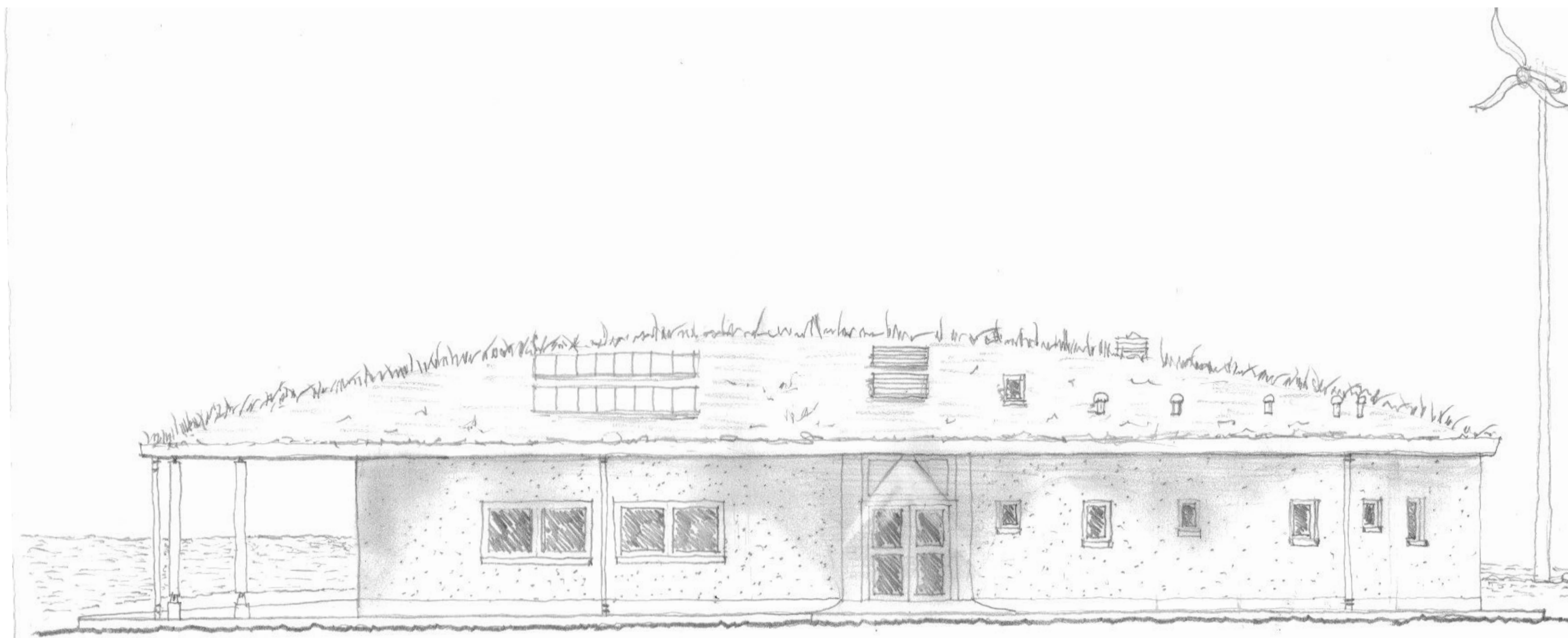
artistic impression from south